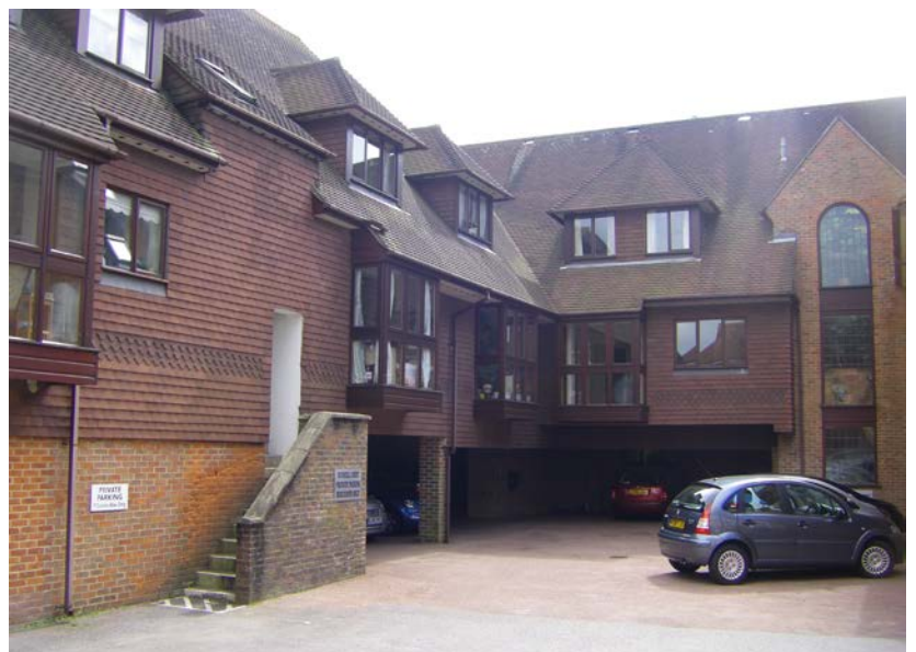
Main courtyard at Russell Court.

A one-bedroom second floor retirement apartment in a popular development close to shops