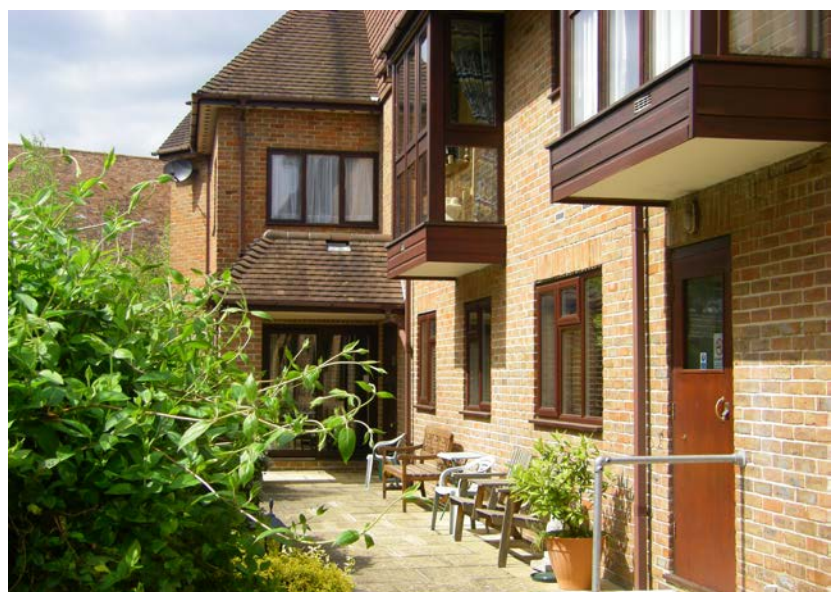
Communal garden area.